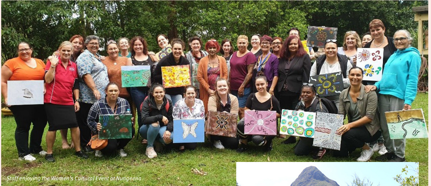
Staff enjoying the Women’s Cultural Event at Nungeena