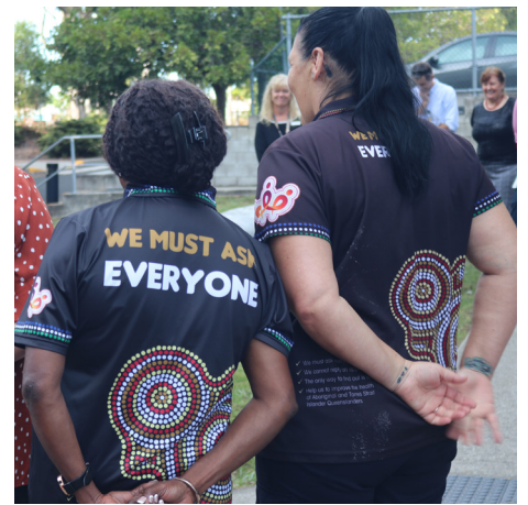
Indigenous Health – We must ask everyone!