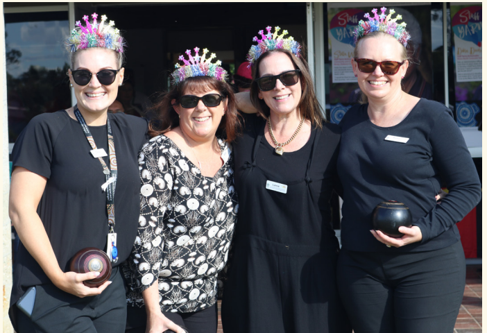
The Unbelievabowls - winners are gridders!