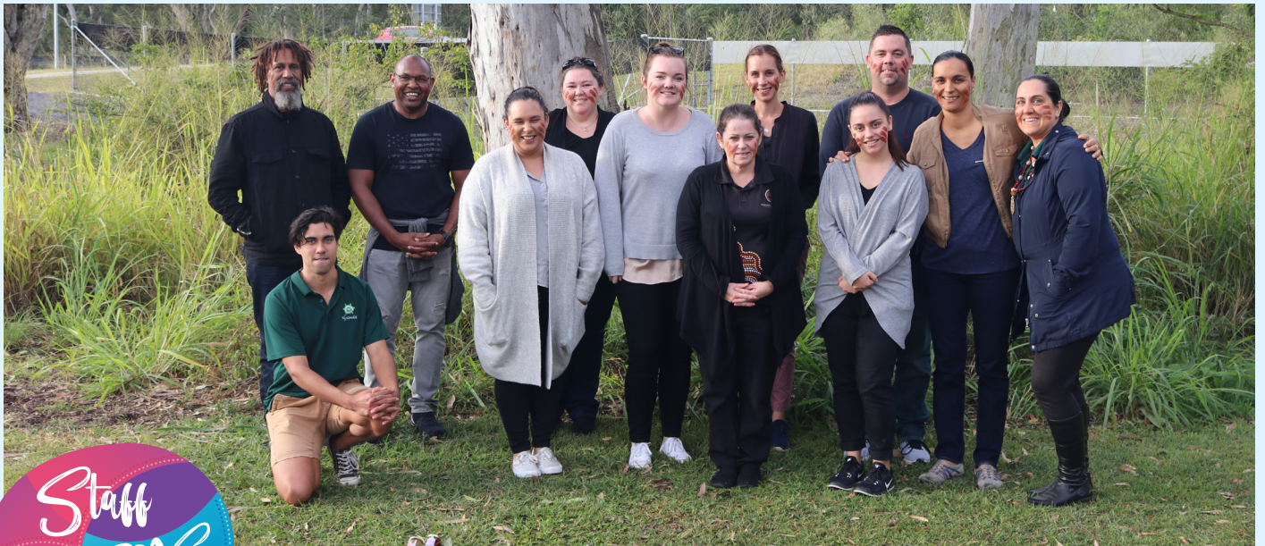
Staff enjoying the cultural experience.