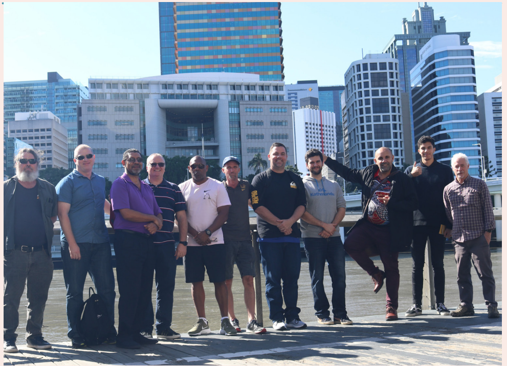
The men started their day with a trip to Blackcard Cultural Tours at Southbank.

The second half of the day saw the group move on to Wynnum to visit the Mangrove Boardwalk and the Bayside parklands along beside Lota Creek. Attendees were impressed with the high level of knowledge of the area shown by guides and certainly regarding the Native Title Act of the boundaries. The day was heralded as a great success by everyone and all are looking forward to the next event.