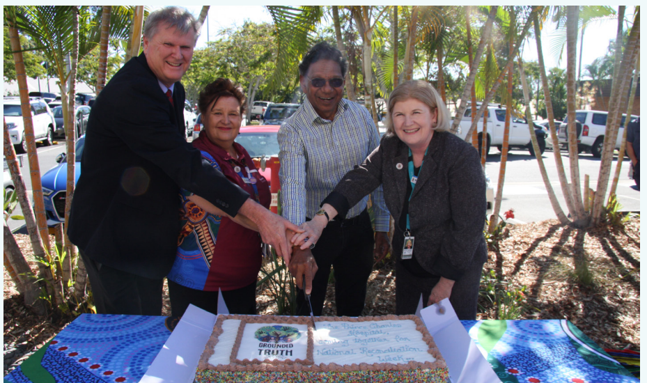
Cutting the cake to be shared at the TPCH Reconciliation celebration.