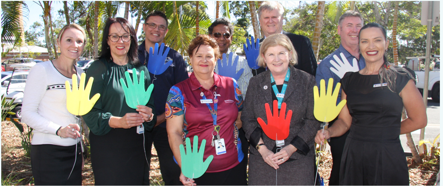
TPCH Executive team members holding a rainbow of Indigenous coloured hands for planting in the garden.