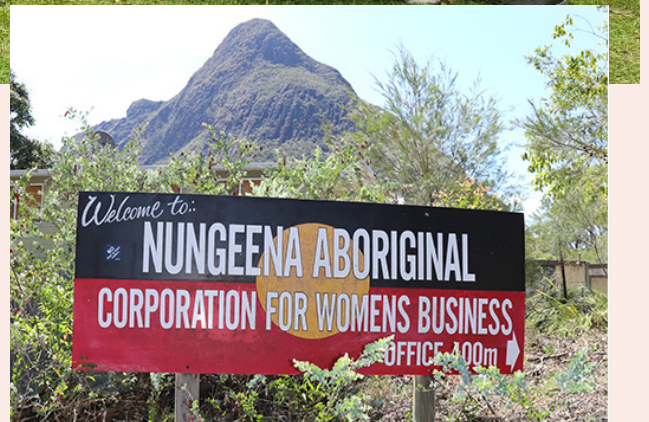
A very spiritual view of Tibrogargan as you enter the Nungeena Aboriginal Corporation site.

After lunch staff were given the chance to create their own dot painting with valued input from elders on the day, all the while, in the background is the magnificent view across to the Glass House Mountains, a very sacred sight for our First Nations Peoples.