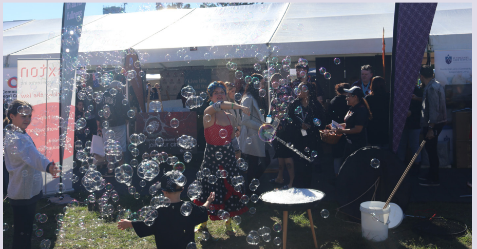
Bubbles of fun for the children.