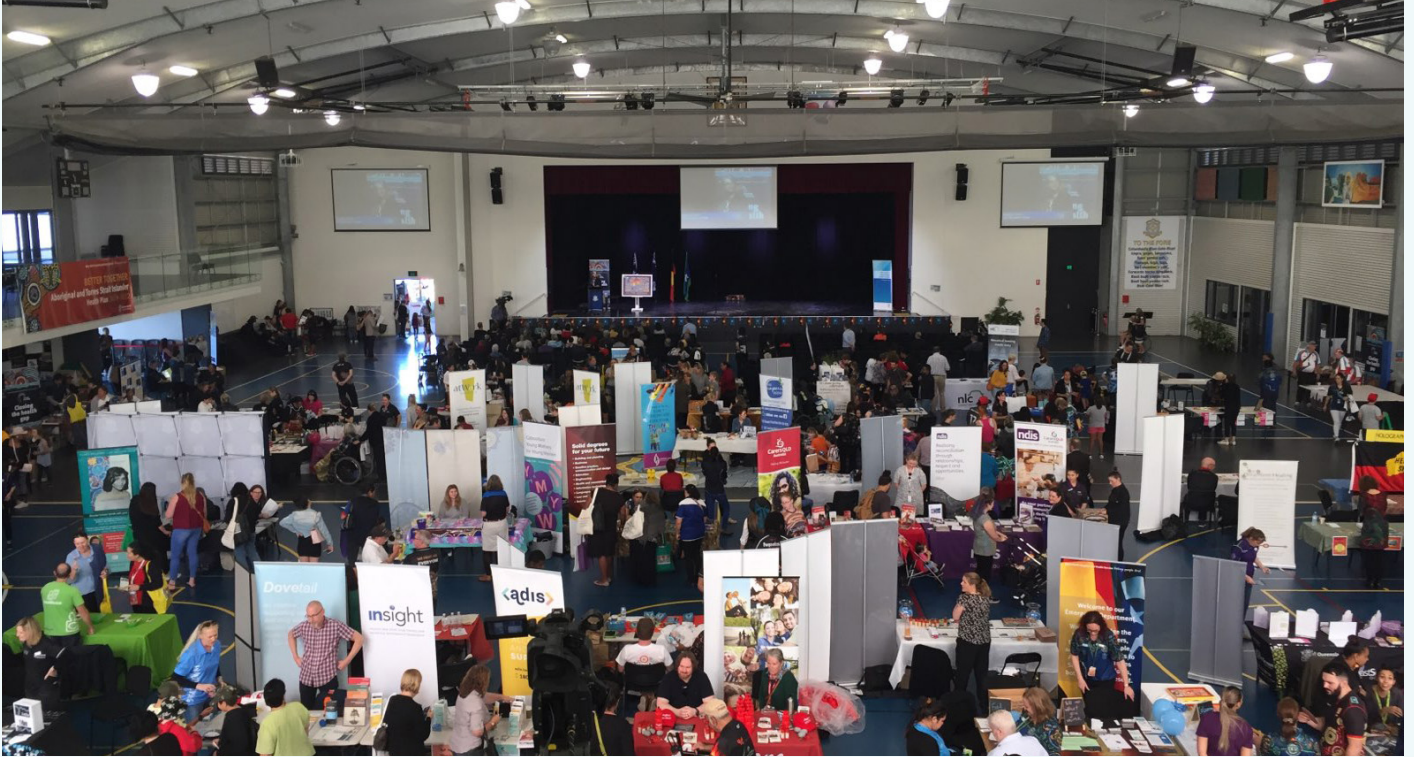
Overlooking the crowd enjoying NAIDOC Week.