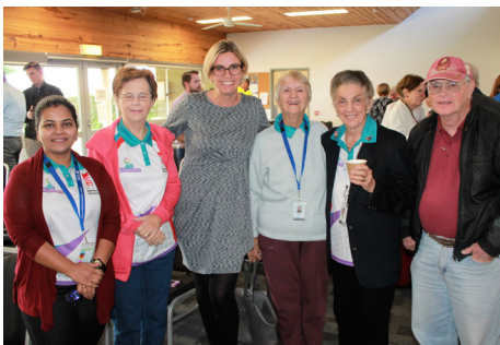
Staff and community enjoying the event.

The Brighton Wellness Hub, which was formally known as the Eventide Bowls Club, has been refurbished so that it can become an important community space where people can gather, host their events and share information. It was officially opened on 6 June 2019 and all are welcome to use this great facility!