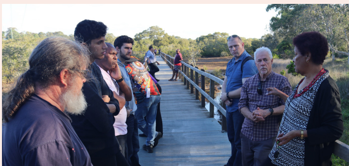
A guided tour of the Mangrove Boardwalk and the Bayside parklands along beside Lota Creek completed a full day for the men’s gathering.

The Men’s Gathering was attended by fifteen staff who visited Blackcard Cultural Tours at Southbank.