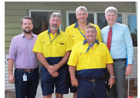
The groundsmen were happy to be part of the official gathering.