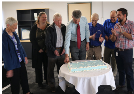
Officials cutting the cake for the opening of the Brighton Wellness Hub.