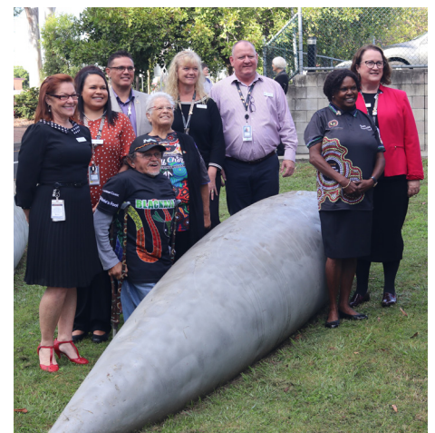
Flag Raising Committee from Redcliffe Hospital.