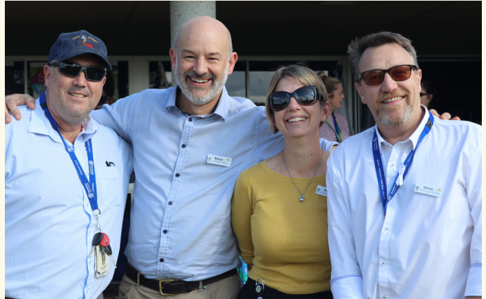
Executive staff lining up to cheer on the teams.