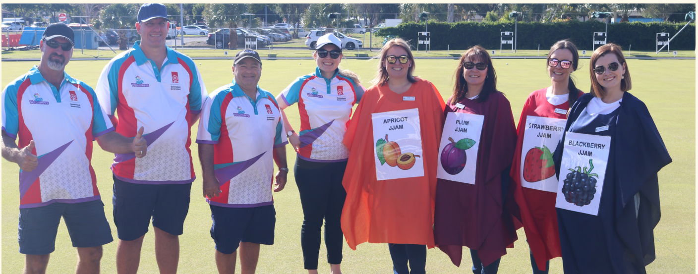
Team colours the theme for the day.