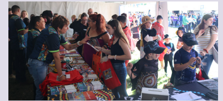
The Better Together stand proved popular amongst the attendees.