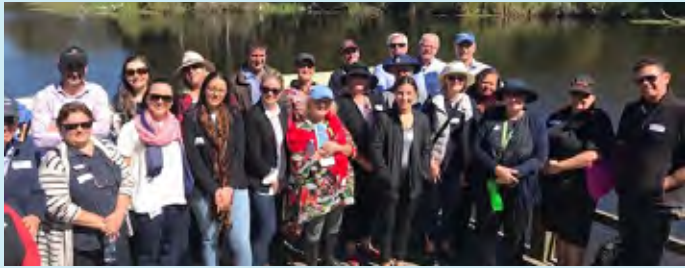
Members from the RBWH Reconciliation Action Plan Committee took part in a cultural awareness session with Nyanda Cultural Tours to learn more about the local history.