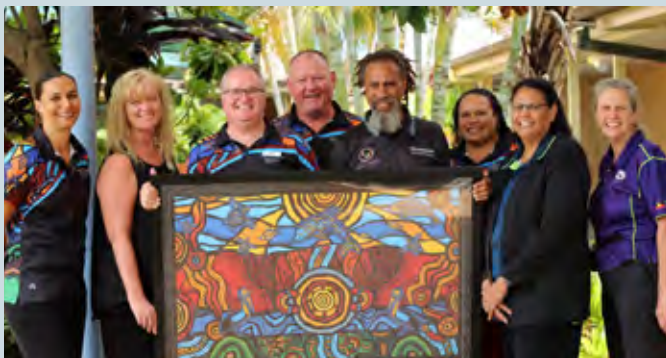
Members of the Redcliffe Reconciliation Action Plan committee