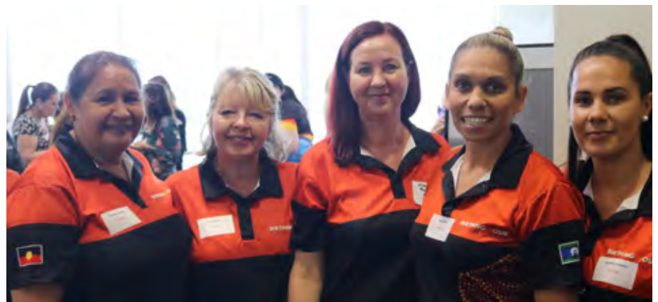
Partnering with the Institute of Urban Indigenous Health BIOC program to deliver enhanced maternity care and community pathways for mums and bubs.

With the challenges of COVID-19 over the past few months, the focus shifted to the development of enhanced initiatives to inform, educate and support the Aboriginal and Torres Strait Islander community during the pandemic. This led to a rapid introduction of the “Better Together Pharmaceutical Program” aimed to provide all Identified patients upon discharge from a MN hospital/facility to receive pharmaceuticals at no cost to the patient to support equitable access to affordable medication to reduce the burden of disease.