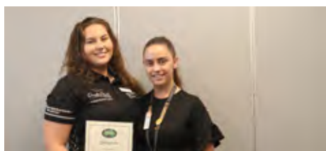
Training the next generation of healthcare leaders through our Deadly Start program.