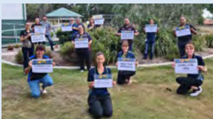
The message from The Prince Charles Hospital team reach 5.8k people and was ‘liked’ by 705 people.