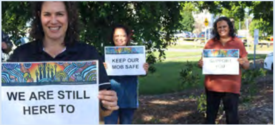
Staff from the A&TSILT created the campaign to support the community during COVID-19 and also draw attention to the fact Indigenous Health Services were still available to care, support and guide them through their journey.