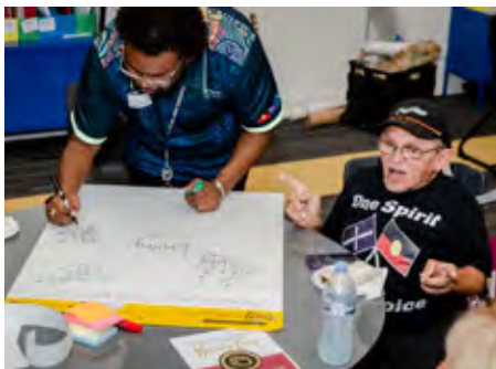
Over 676 pieces of information were gathered as part of developing the Better Together Plan

“In such a short timeframe, I am proud of the achievements of each of our hospital and directorates, they have ensured as a group they are reporting, delivering accountability and implementing local activities and projects to ensure meaningful change for our patients.”