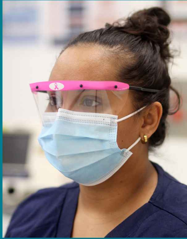
'De Royal Frame' with disposable shield