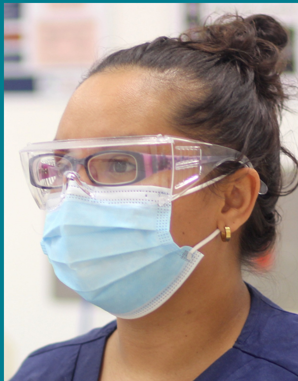
'Livingston' goggles. Suitable option to wear with prescription eyewear.

Thank you for helping keep everyone safe and healthy