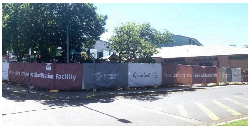
Preparation of the TPCH site is occurring ready for the delivery of the modular building in May.

Offsite fabrication of the modular building commenced at the end of last year. The construction team has set up on site at TPCH with the installation of site fencing and hoarding and the permanent closure of the small endoscopy unit car park. Civil works will start this month to prepare the site for the CSF modular building to be delivered in May. The practical completion of the facility has changed from July to the end of August to accommodate the inclusion of an ambulance bay as part of this project.