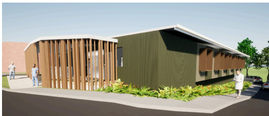
Computer generated image of what the CSF will look like upon completion.

The CSF will deliver a new model of service for our community to help reduce gaps in mental health emergency care and respond to increased mental health crisis presentations within a purpose-built therapeutic environment. The model of service provides an alternative to the emergency department and features a multidisciplinary team with a lived experience focus.