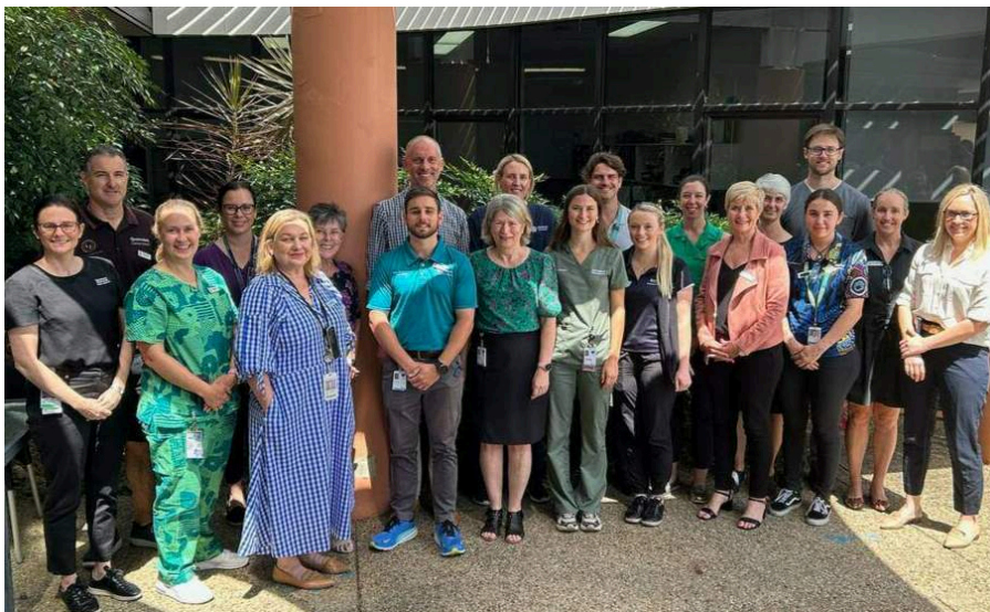
Some of our Allied Health professionals

These staff form an integral part of the multidisciplinary team, with increasing recognition given to the value and leadership allied health professionals bring to the delivery of contemporary health care services. A big thanks to all of our wonderful Allied Health staff at TPCH!