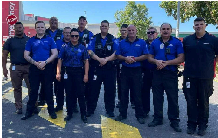
Some members of our Protective Services team

Wednesday was International Healthcare Security Officer Appreciation Day. A big thanks to our Protective Services team who play a vital role in ensuring the safety of our staff, patients and visitors. We're very grateful for the time, commitment and energy our security officers invest in the care and protection of the people of TPCH. Keep up the great work team!