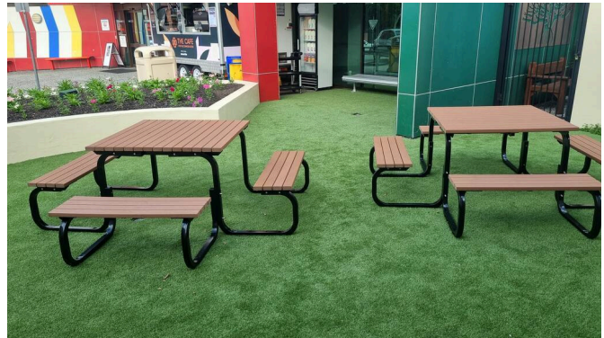
ED courtyard after