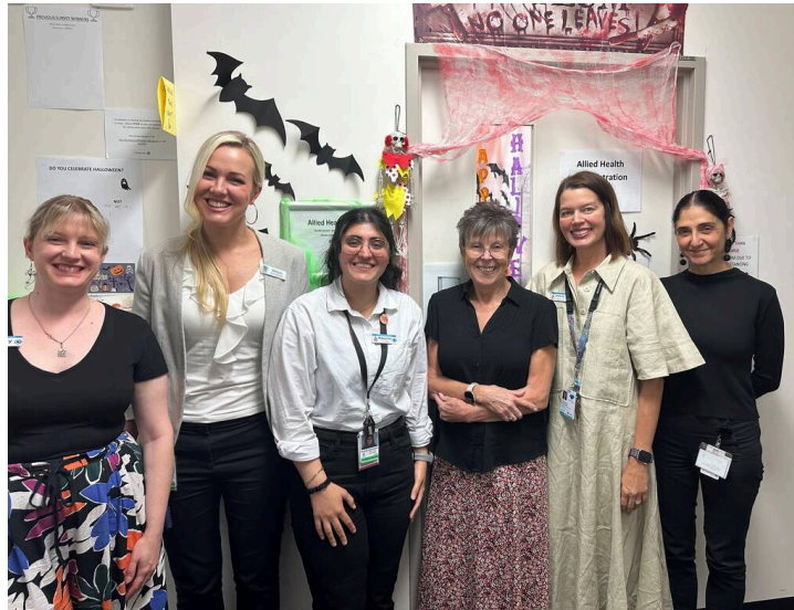
Psychology team visit

comprehensive neurocognitive, neurodevelopmental and differential-diagnosis assessments in areas such as dementia, post-stroke, ADHD, ASD and many other cognitive concerns. Last financial year, the team provided 3,200 outpatient sessions, and psychological care to more than 350 individual patients. There is definitely some innovative work being done by this team!