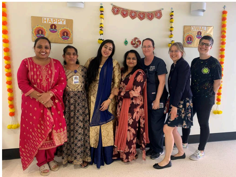
GEM Unit Diwali celebrations

Our GEM team continued the festivities this week with a special celebration for Diwali. Diwali is a Hindu festival which symbolises the spiritual victory of light over darkness and good over evil. The Indian festival is considered a bonding period for families and communities to cultivate a spirit of togetherness and festivity. Members of our GEM team celebrated the occasion by bringing in some traditional food for their colleagues to share in and enjoy. A wonderful display of generosity and culture. Happy Diwali week everybody!