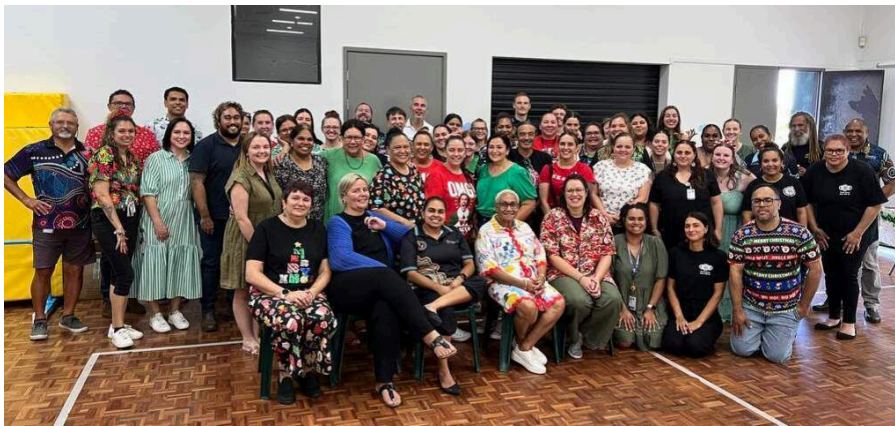
Deadly Awards event