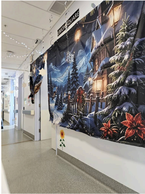
New York Christmas (pictured left)

The decorations displayed a collaborative approach with ability for patient interaction throughout the ward. Asking patients to find the “elf” promotes mobility and is a great reminder that activity can prevent functional decline in our admitted patients.