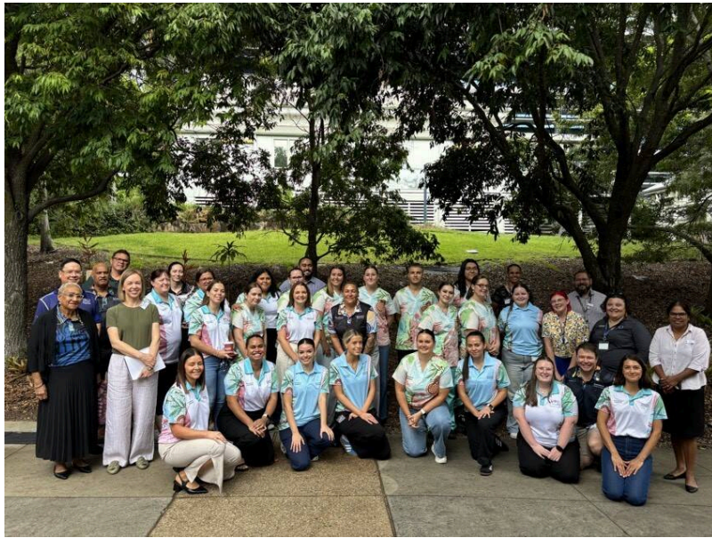
Welcoming our cadets