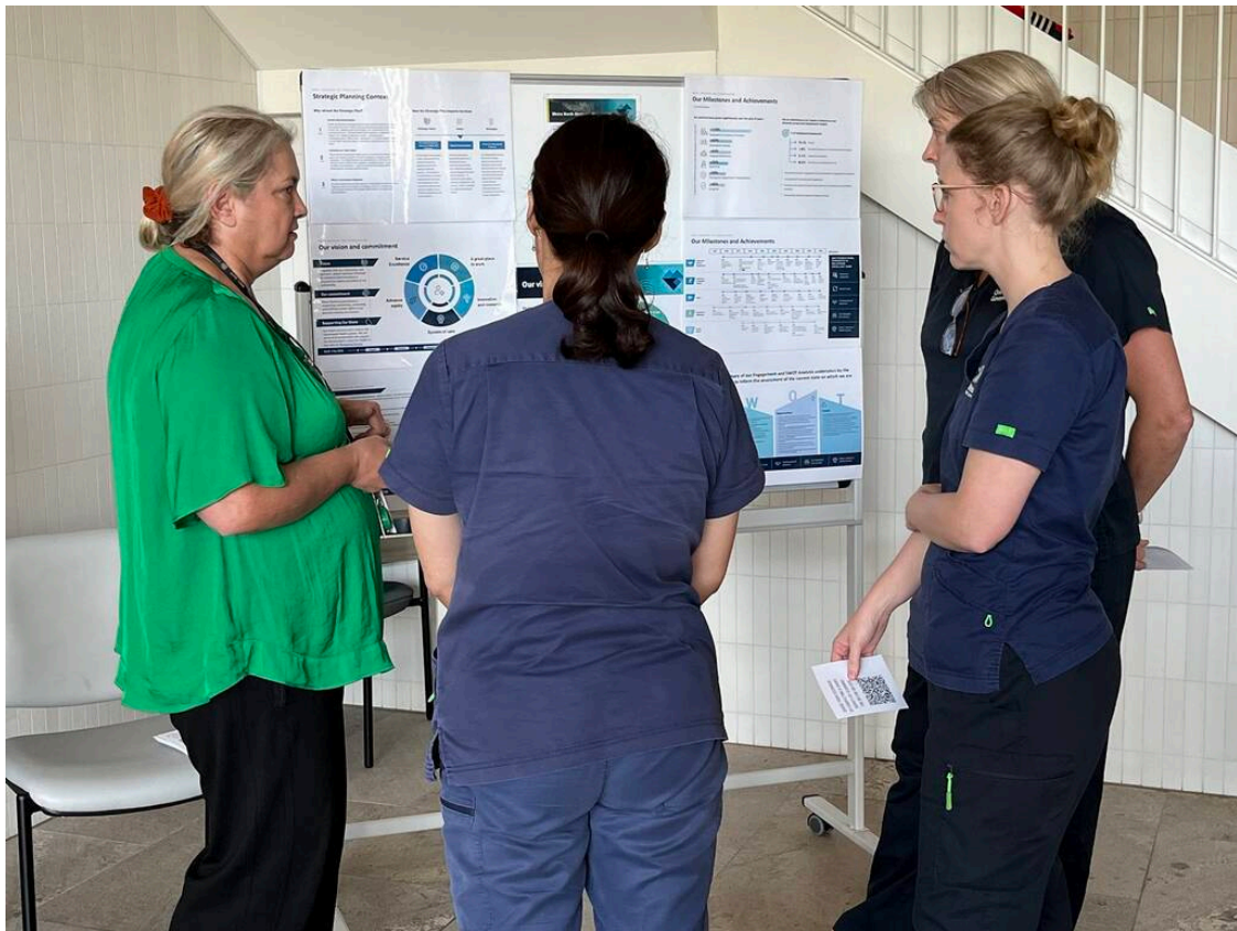
Strategic Plan feedback pop-up session at STARS.