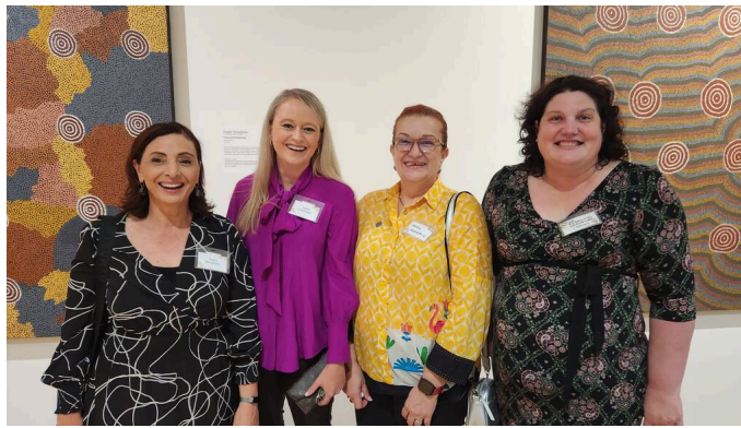
Women in Science High Tea event