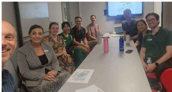
Podiatry team meeting