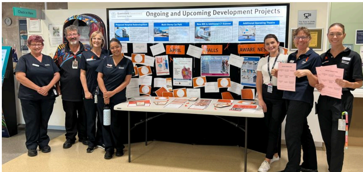
Above: Marking Falls Awareness Month at Redcliffe Hospital