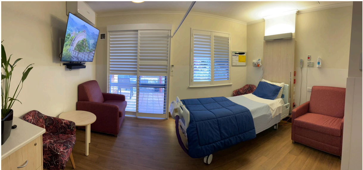
Above: Funds raised from the 2024 Reddy Fun Run were used to refurbish an end-of-life room.

The fun run is a joint event of REDDY Fun and Fitness and the Hospital Auxiliary. It is a great opportunity for passionate staff and volunteers to come together with the community for a day of fitness, fun and fundraising.