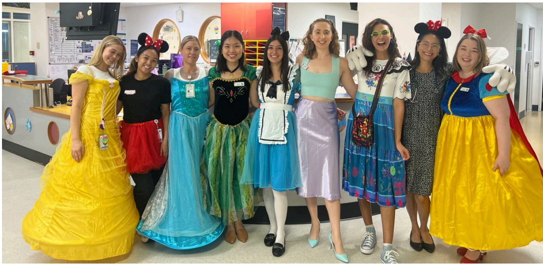
Above: Paediatric Ward staff embraced the Disney theme at work on Thursday.