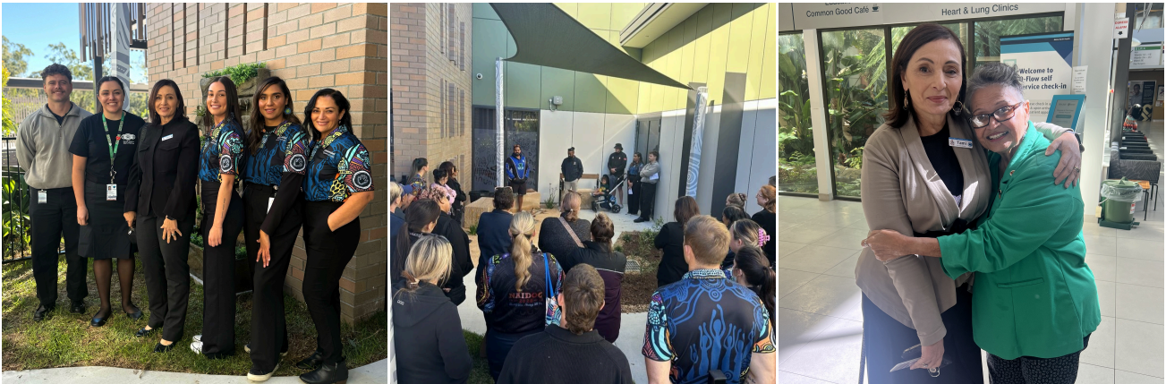
Kallangur Satellite Health Centre's garden opening

The space came together through close consultation with staff and community to create a culturally safe place for rest, connection and healing. It's a meaningful addition to the centre and one that is already bringing people together.