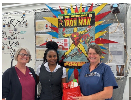
Adult Cystic Fibrosis Centre