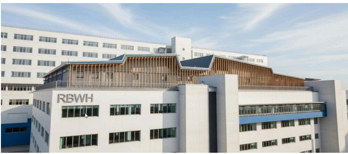
Artist impression of the new CRD to be built on Dr James Mayne Building.