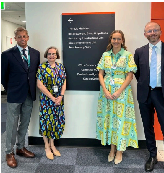
RBWH Board visit

Whilst at RBWH I also made an impromptu visit to touch base with the Medical Records team as they get ready for ieMR go-live in October. A big thank you to the team who showed me the ropes on how to scan patient documents, which is a key part of the digital preparation required for ieMR system rollout. This was an excellent way to get immersed in the important work our staff do behind the scenes across the health service.