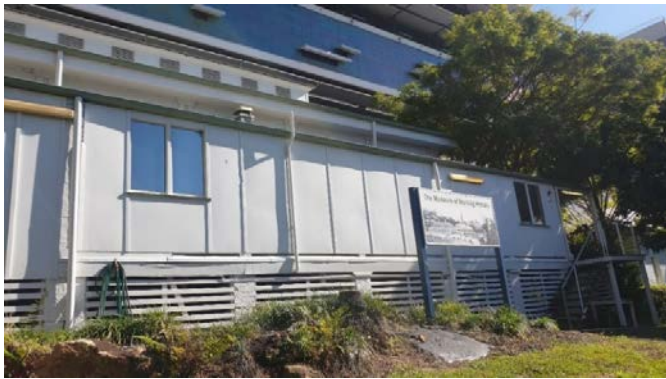
Image: Exterior of Museum