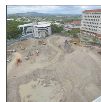
11 December 2017