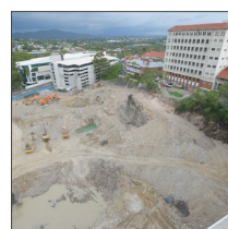
4 December 2017