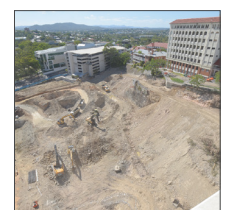
18 December 2017

If you have any concerns please get in touch by