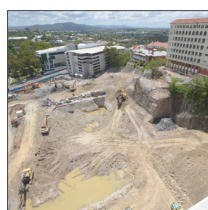
27 November 2017