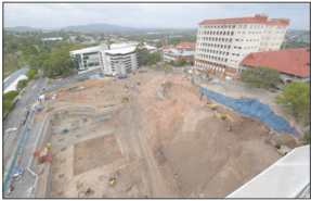
21 February 2018