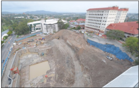
24 March 2018