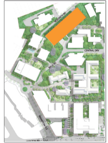
Northern carpark site location