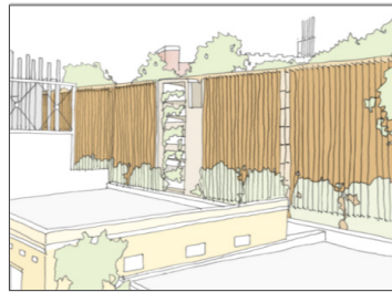
Northern carpark artist impression

Construction is anticipated to commence in the second half of 2018. Further information will be made available about construction activity closer to commencement.