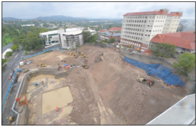
6 March 2018