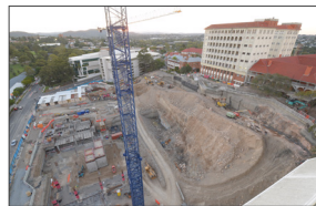
15 June 2018