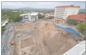
7 April 2018