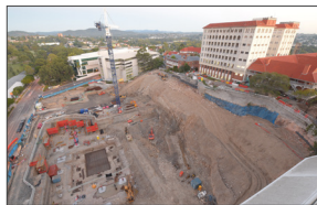
14 May 2018