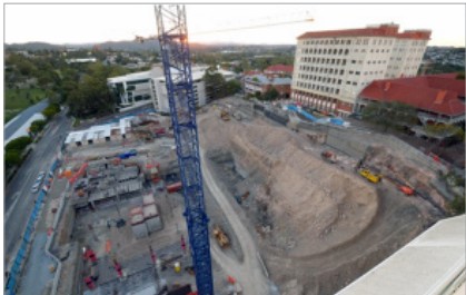
18 June 2018