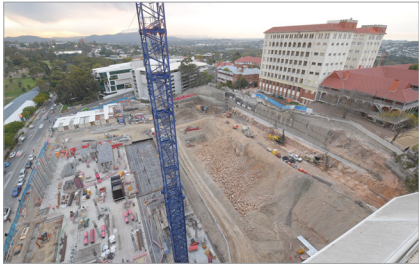
25 July 2018