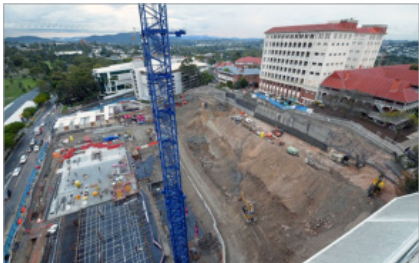
11 July 2018