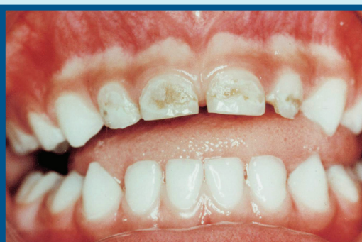
More advanced decay: Can look like brown spots on the teeth