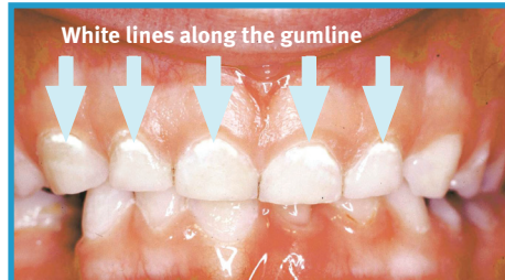
White lines along the gumline

Arrange a dental appointment for your child by age two years.